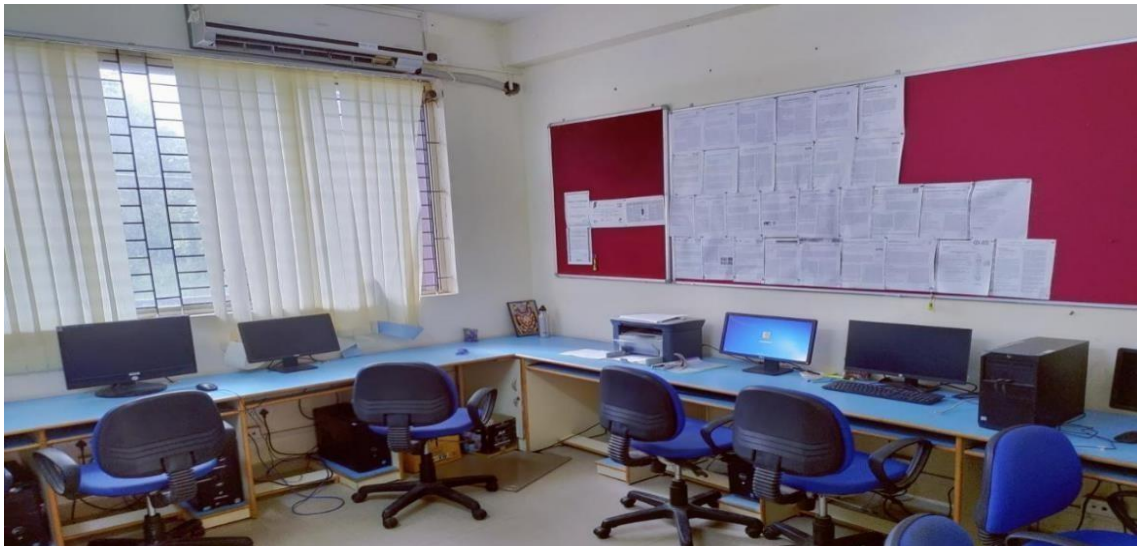
Data Science and Computer Lab