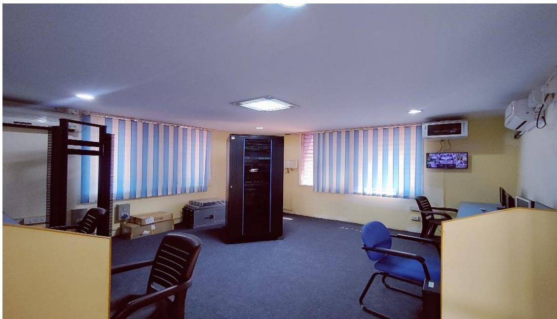
Network Operating Center