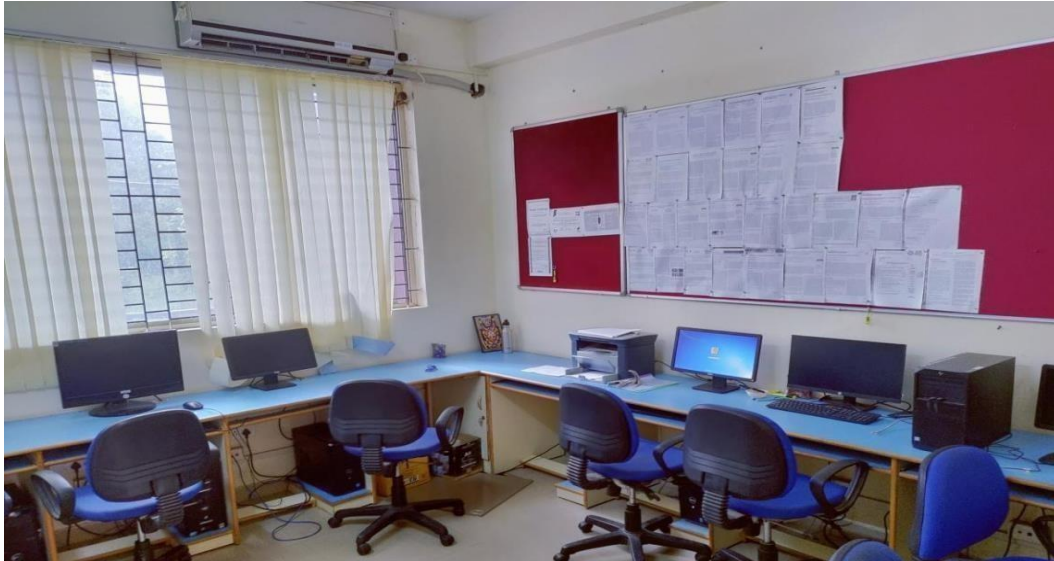
Computer Vision and Pattern Recognition Laboratory