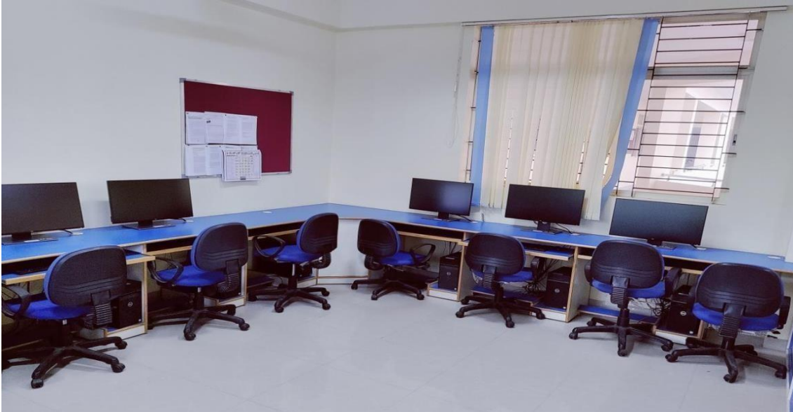
PG Computer Lab