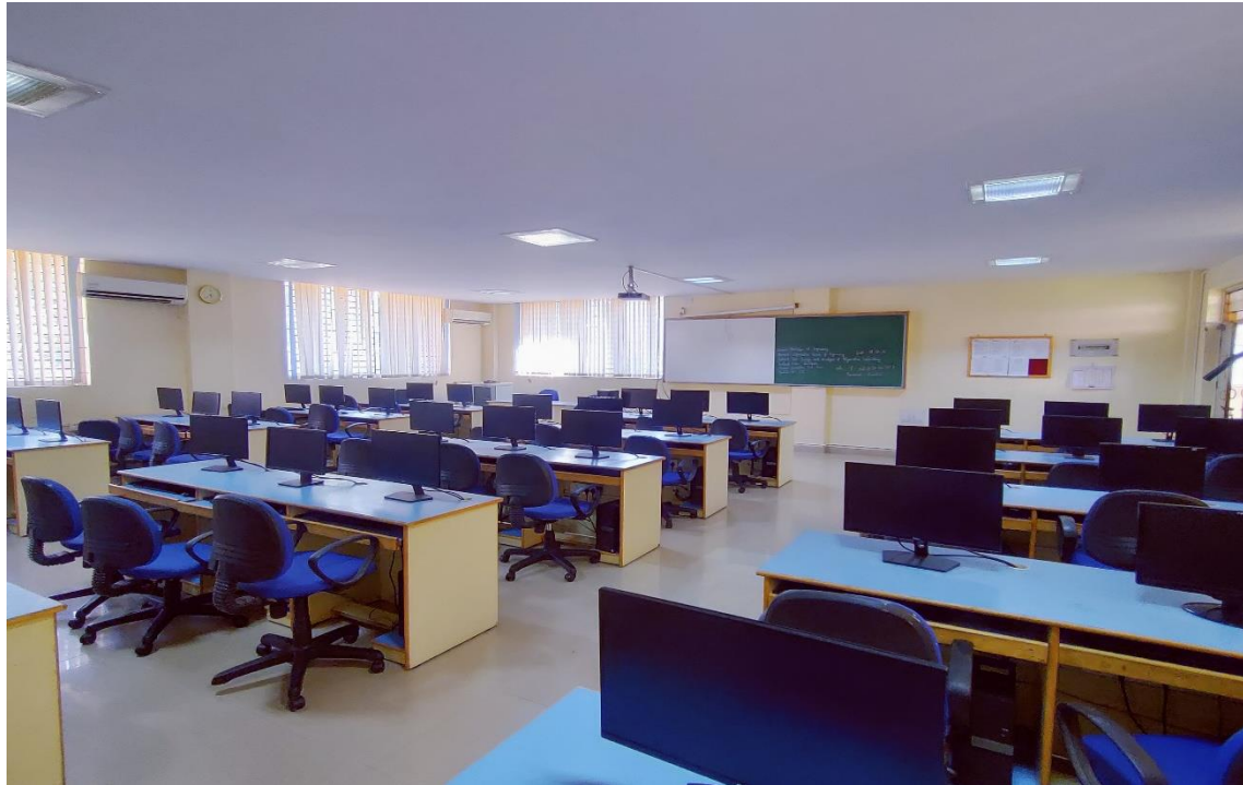
ISE COMPUTER LAB-1